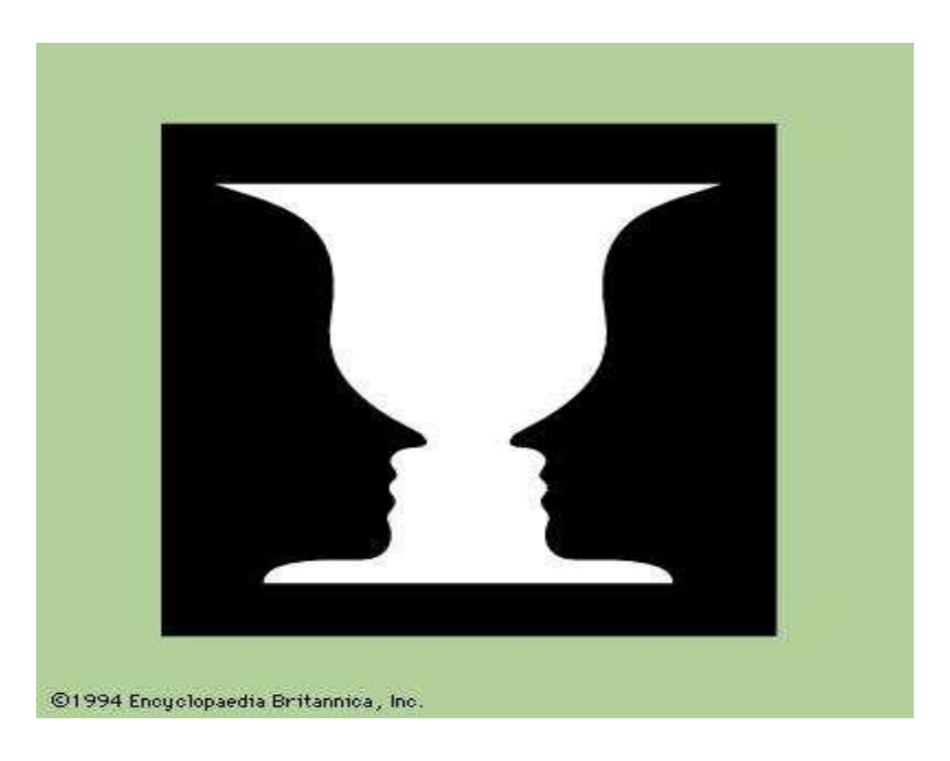
Figure 1: Ambiguous figure seen as either a white vase or two black profiles. Encyclopædia Britannica, Inc.

The "figure-ground" illusion is commonly experienced when one gazes at the illustration of a white vase, the outline of which is created by two black profiles. At any moment, one will be able to see either the white vase (in the centre area) as "figure" or the black profiles on each side (in which case the white is seen as "ground"). The fluctuations of figure and ground may occur even without conscious effort. Seeing one aspect usually excludes seeing the other.