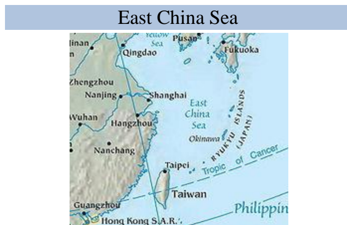
The East China Sea, showing surrounding regions, islands, cities, and seas