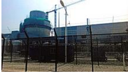
Sanmen Nuclear Power Plant, located in Zhejiang China

The Westinghouse AP1000 is the main basis of China's move to Generation III technology, and involves a major technology transfer agreement. It is a 1250 MWe gross reactor with two coolant loops. The first four AP1000 reactors are being built at Sanmen and Haiyang, for CNNC and CPI respectively. At least eight more at four sites are firmly planned after them. In 2015 the build was reported to be running over two years late, mainly due to key component delays and project management issues.