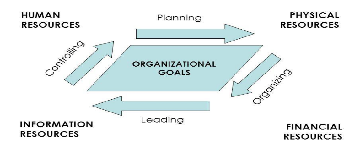
Figure 1: Administrative Process