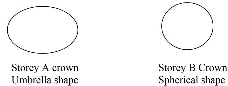
Fig. 1.3 showing different tree crowns.

Storey C : Trees of this storey are not buttressed. They have short boles. Their crowns are deeper and conical in shape and they form the lower canopy of the rainforest. They produce flower and fruit directly on the stem. Examples are Irvingia gabonensis, Celtis zenkeri and Myrianthus arboreus .