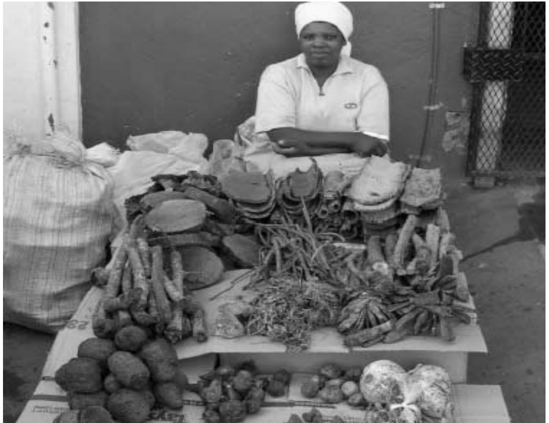
Fig. 2.6: Medicinal Plants and Products as Source of Income