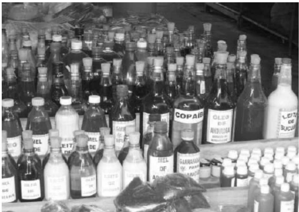
Fig. 2.7: Drugs Manufactured from Tropical Medicinal Plants