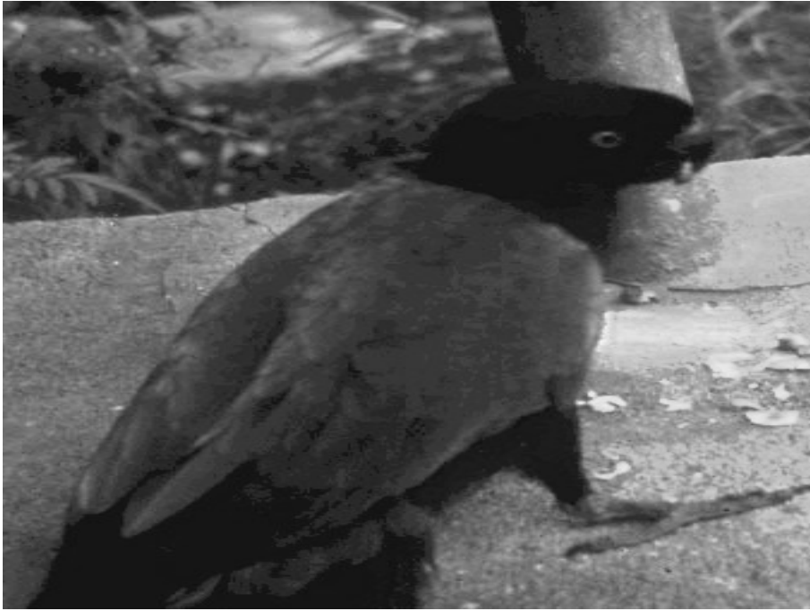
Fig. 1b: Bird Species