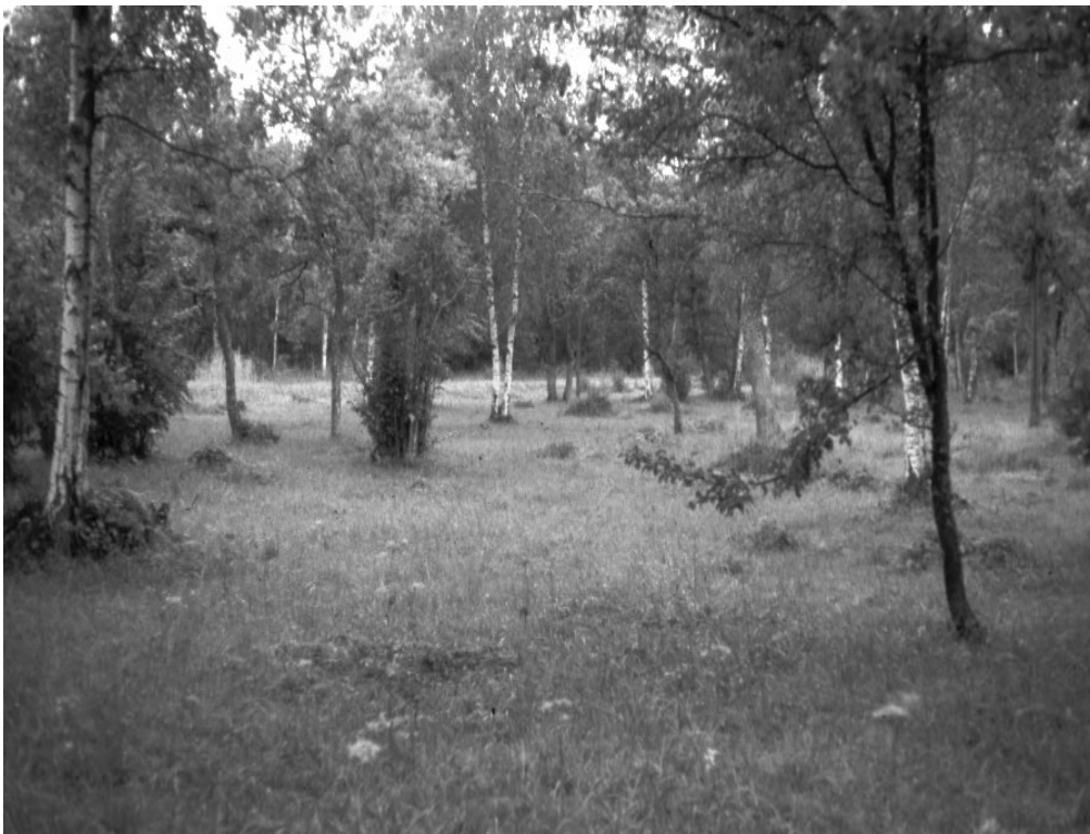
Fig. 2a : Plant Diversity