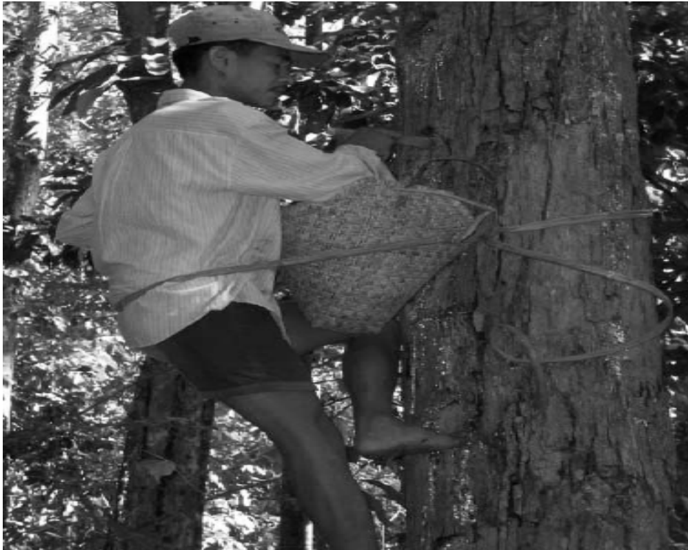
Fig. 2.2: Rubber Tree as Source of Income

Tropical forests provide many valuable products including rubber, fruits and nuts, meat, rattan, medicinal herbs, floral greenery, lumber, firewood and charcoal (Figure 2.2). Such forests are used by local people for subsistence hunting and fishing. They provide income and jobs for hundreds of millions of people in small, medium and large industries. Tropical forests are noted for their beautiful woods (Figure 2.3).