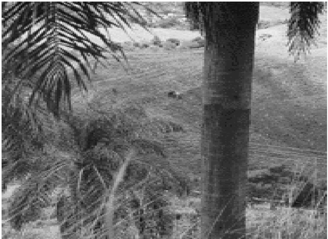
Fig. 2.4: Example of Tropical Forest Wood

Four important commercial woods are mahogany, teak, melina and okoume. Honduras mahogany ( Swietenia macrophylla ), grows in the Americas from Mexico to Bolivia. A strong wood of medium density, mahogany is easy to work, is long lasting, and has good color and grain. It is commonly used for furniture, molding, paneling and trim. Because of its resistance to decay, it is a popular wood used in boats. Teak ( Tectona grandis ) is native to India and Southeast Asia. Its wood has medium density, is strong, polishes well, and has a warm yellow-brown color. Also prized for resistance to insects and rot, teak is commonly used in cabinets, trim, flooring, furniture, and boats. Melina ( Gmelina arborea ) grows naturally from India through Vietnam. Noted for fast growth, melina has light colored wood that is used mainly for pulp and particleboard, matches and carpentry. Okoume ( Aucoumea klaineana ) is native to Gabon and Congo in West Africa (Figure 2.4).