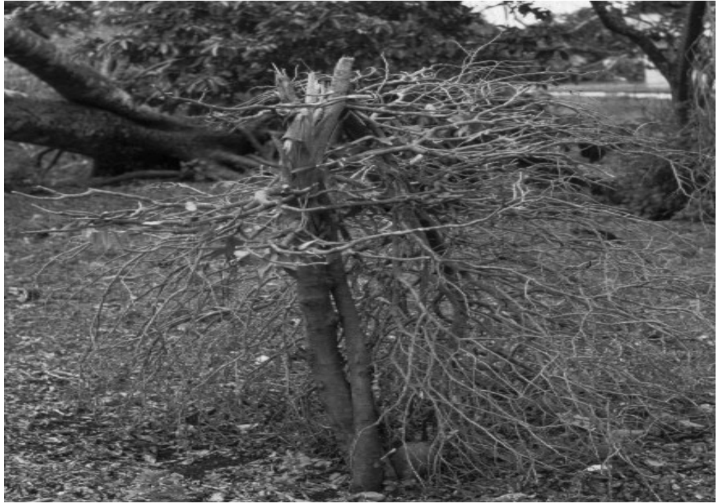
Fig. 2b: Plant Diversity