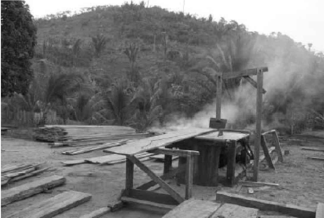
Fig. 2.5: Plywood from Tropical Wood

Tropical forests are home for tribal hunter-gatherers whose way of life has been relatively unchanged for centuries. These people depend on the forests for their livelihood. More than 2.5 million people also live in areas adjacent to tropical forests. They rely on the forests for their water, fuel wood and other resources and on its shrinking land base for their shifting agriculture. For urban dwellers, tropical forests provide water for domestic use and hydroelectric power. Their scenic beauty, educational value and opportunities for outdoor recreation support tourist industries.