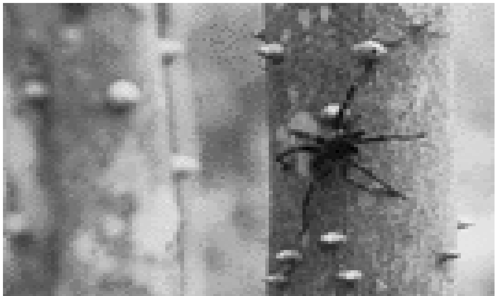
Fig. 2.1: Example of Tropical Rain Forest Insect

There is also diversity in other life forms: shrubs, herbs, epiphytes, mammals, birds, reptiles, amphibians and insects. One study suggests that tropical rain forests may contain as many as 30 million different kinds of plants and animals, most of which are insects (Figure 2.1).