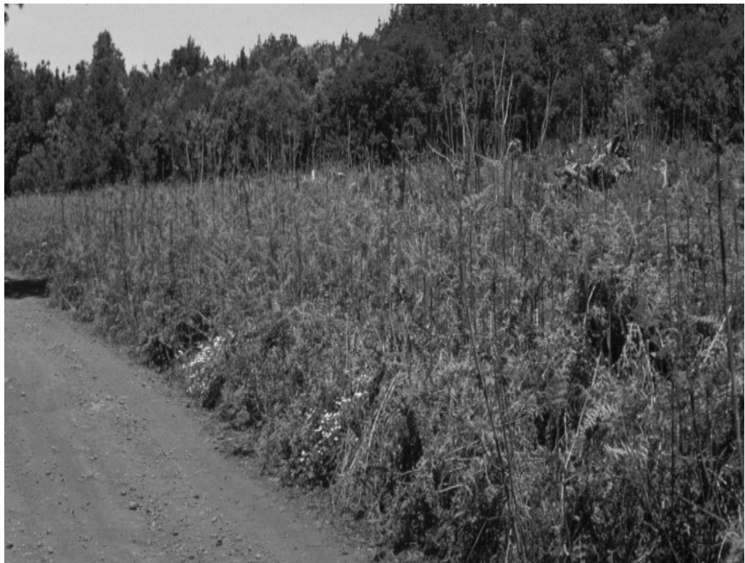
Fig. 2c: Plant Diversity