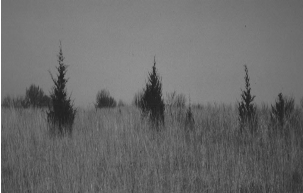
Fig. 2d : Plant Diversity