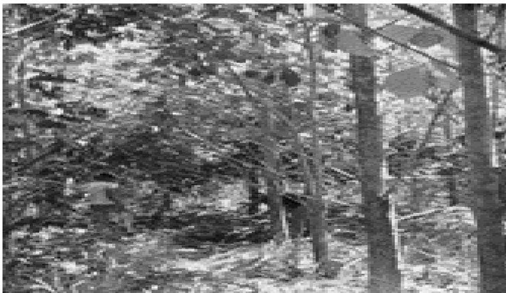
Fig. 2.3: Tropical Forest