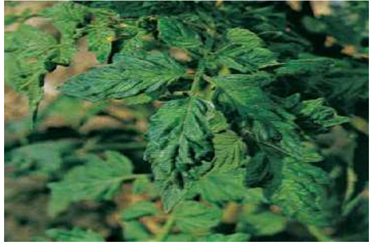
Tomato leaves puckered and blistered by the tobacco mosaic virus.

Potato leaf infected with a fungal blight.