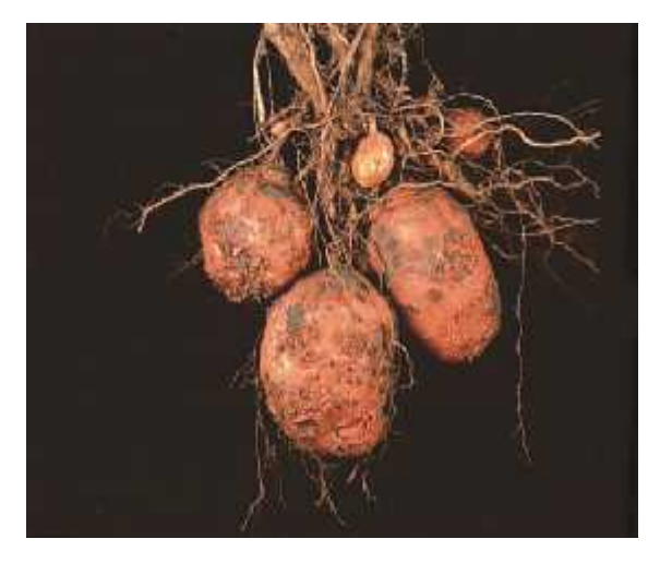
Potato scab Common scab of potato

Potato leaf infected with a fungal blight.