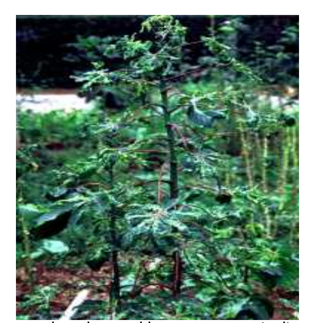
Cassava plant damaged by cassava mosaic disease