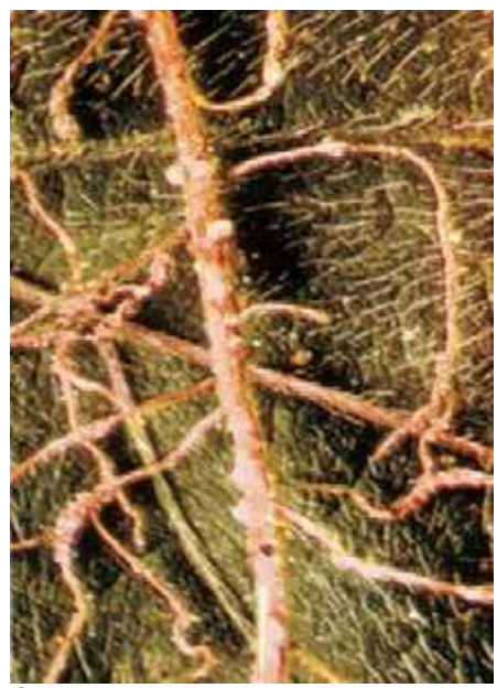
Cysts or tiny nodes on soybean plant roots, containing eggs of nematodes.