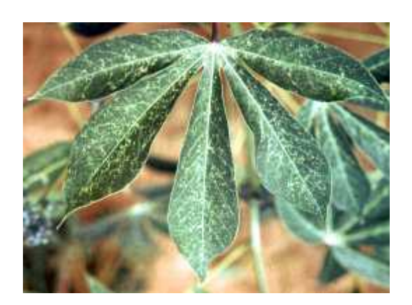
Cassava leaf with spots caused by cassava green mite

a) Select 3 crops common in your locality and identify the prevailing diseases. Prepare a disease album for the selected crops