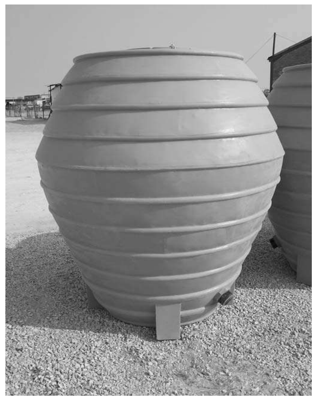
Figure 6.3.5 Plastic granary

Plastic drums (fig.6.3.5) of all sorts, including water tanks, can be sealed and used as effective hermetic grain store Figure 6.3.5 Plastic granary