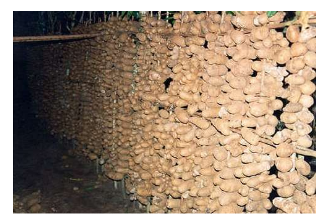
Figure 1.3.5 Typical yam barn in the humid forest zone of Nigeria (individual yams tied to live poles)

The yam barn in the Guinea Savannah zone is constructed from guinea corn stalk, sticks, grass and yam vines (fig.2). The yams are heaped at different positions in the barn. Such barns areconstructed every year and are situated near the house under a tree to protect the tuber from excessive heat. At the end of the storage period the barn is burnt down and inDecember/January a new structure is built for the next harvest. Unlike the humid forest where it is important that the yams are separated to avoid rotting, in drier areas such as Niger State the yamscan be stacked into piles in the barn.