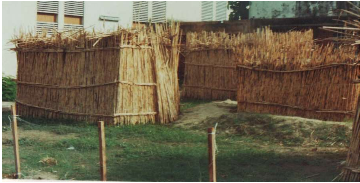
Figure.2.3.5 yam barn in guinea savanna

At the onset of the rainy season the yams are transferred to a mud hut or guinea corn storage rhombu to protect them from the rain. Another yam storagestructure found in the savanna region is the yam house or yam crib. "Yam houses" havethatched roofs and wooden floors, and the walls are sometimes made simply out of bamboo. They are raised well off the ground with rat guards fitted to the pillars. Yam tubers are stacked carefully inside the crib (Figure 3). Yam is also stored underground in trench or clamp silos. In both methods a pit is excavated and lined with straw or similar material. The tubers are then stored on the layer of straw either horizontally on top of each other or with the tip vertically downwards beside each other. The yams are then covered with straw or similar materials; in some cases a layer of earth is alsoadded.