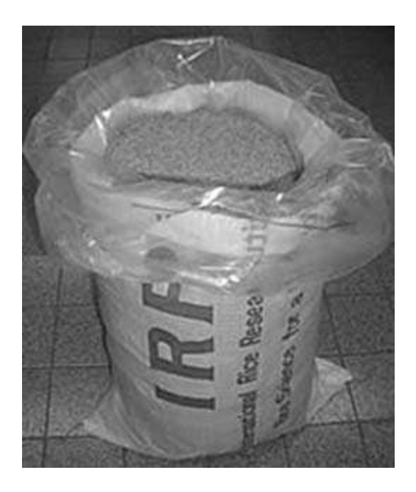
FIGURE 5.3.5. IRRI super bag (the gas- and moisture proof liner)

Bags and other storage structures (Figure 5.3.5) made of plastic have the advantage that they can be made airtight (hermetic). Under such conditions, biodeterioration can be slowed. One such method currently under extensive promotion is the use of "triple bagging" for cowpea storage, although it could be adapted for grains. The triple-bagging technique was developed as an effective hermetic storage method in Cameroon using two inner bags made of 80 micron polyethylene and one outer, more durable bag to help protect against damage. Well-dried cowpea fills the first bag, which is tied shut securely using string. The first bag is placed within a second bag, and this is closed securely. A third bag is used to enclose the first two and to protect against damage. Clear plastic bags are recommended so that the cowpea can be inspected easily for any signs of insect attack. It is also recommended that the bags should remain sealed for at least two months after they are filled, and after they are opened, they should be resealed quickly to prevent entry of pests. The bags mustbe kept safe from rodents that might make holes in them and so break the seal.