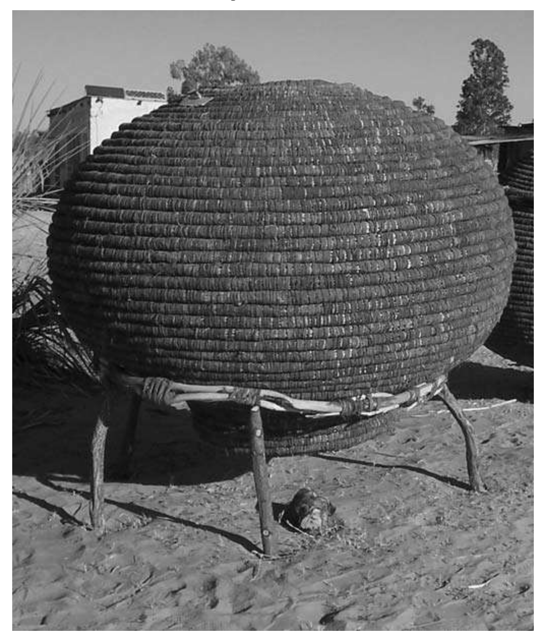
FIGURE 7.3.5 The traditional mopane wood model